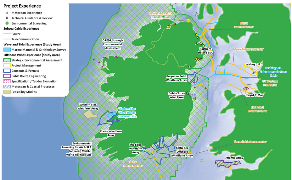
Offshore wind experience

More recently we have supported fixed and floating offshore wind developers on the East, West and South Coast of Ireland with site selection, constraint studies, Foreshore Licence Applications for site investigation works, early project feasibility studies, and environmental surveys (marine mammals & ornithology).